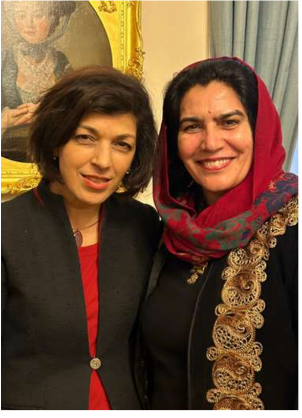
Fig. 7.10. Meeting with Rina Amiri, U.S. Special Envoy for Afghan women, girls and human rights during UN meeting in Doha