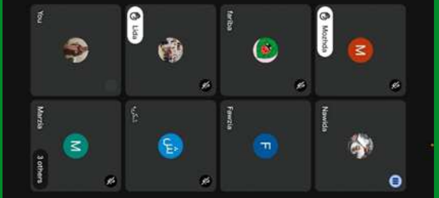
Fig. 7.1. During engaging diaspora mentoring programs