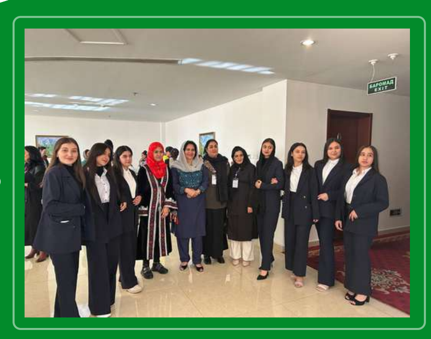
Fig. 7.4. Peace Turkey workshop

Fig. 7.3. Young diaspora and mix diaspora leadership conference