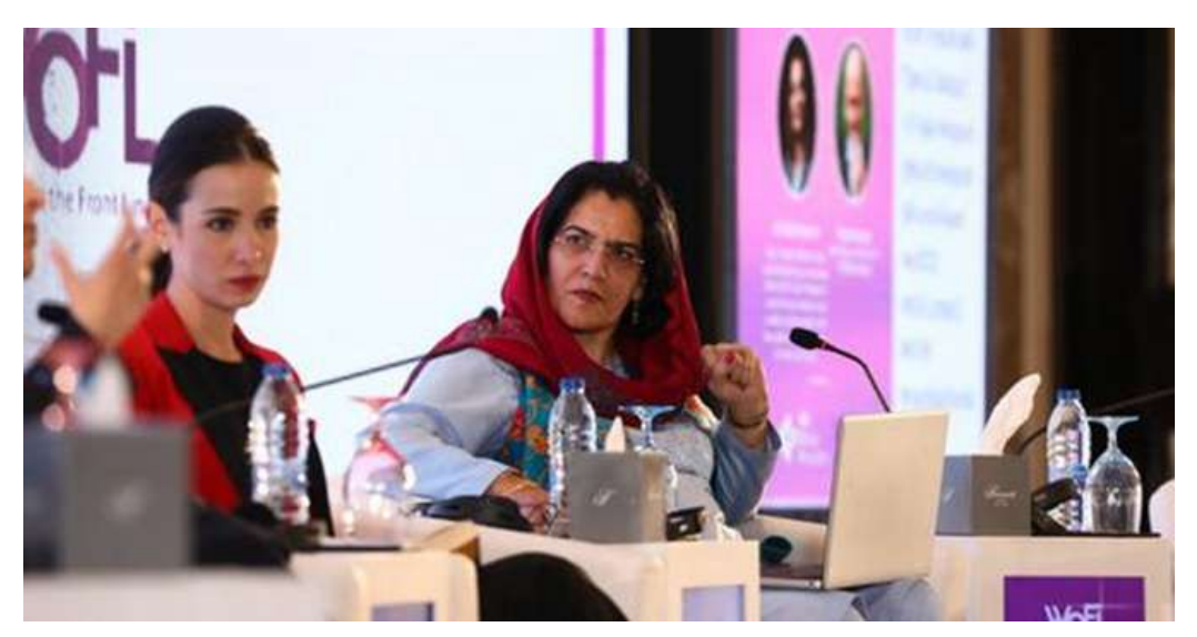
Fig. 7.7. Women on the front line conference in Jordan in Feb 2024