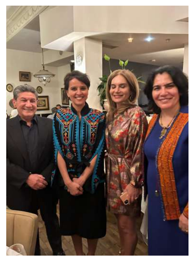
Fig. 7.9. With former Minster of Education of France during UN meeting in Doha