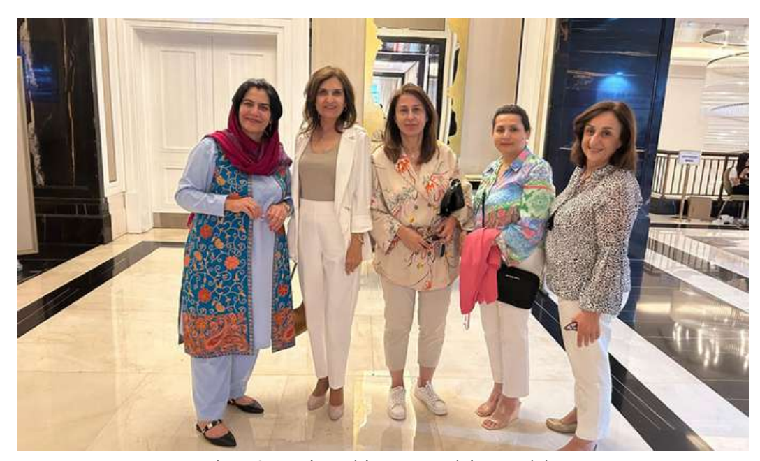
Fig. 7.8. Jordan with women rights activists