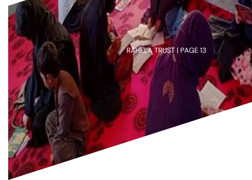
Fig. 6.5. F. S. during the educational programs