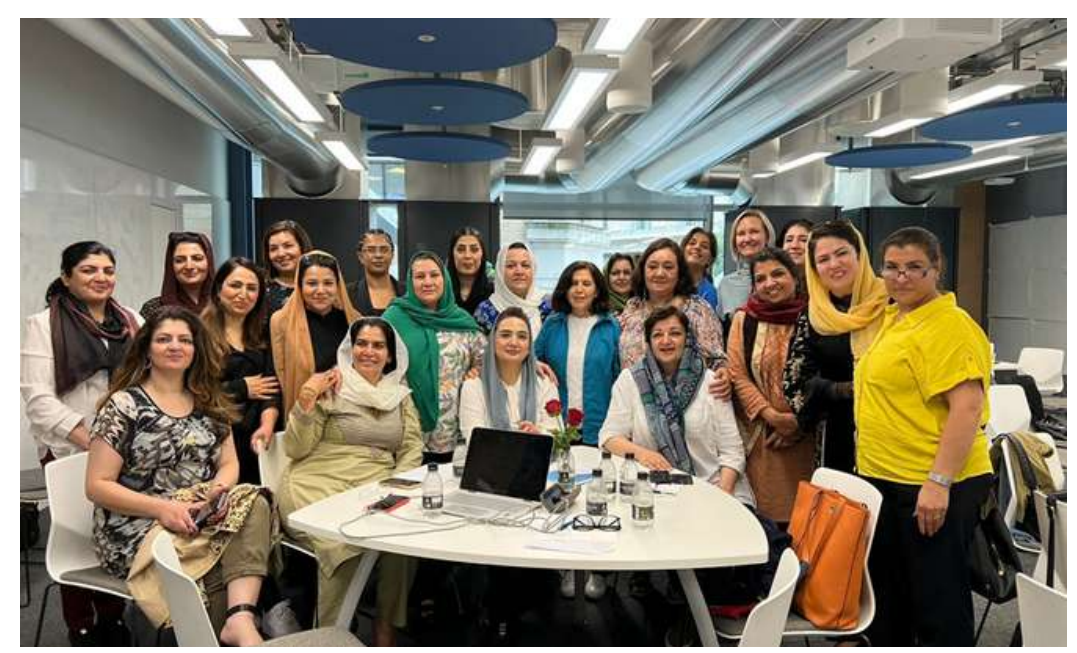
Fig. 7.5. Afghan Women strategic conference by Women Peace and Participations (WPP)