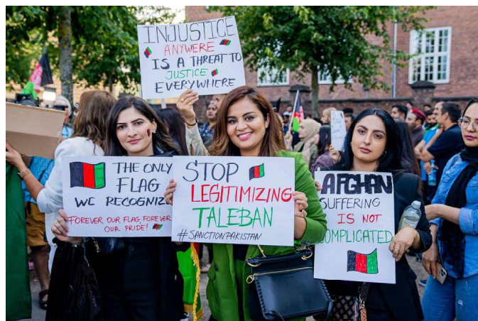
Afghan demo in Denmark